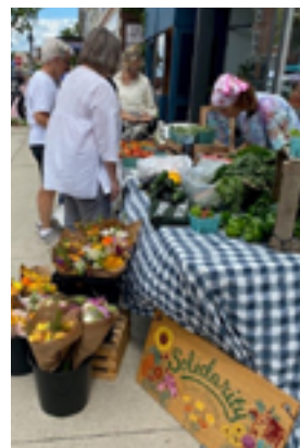
Visit to farmer's market booth of Solidarity Urban Farms (ministry of CotR)