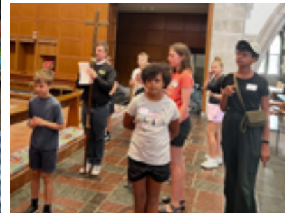
Youth Group Bonfire at the Quill's